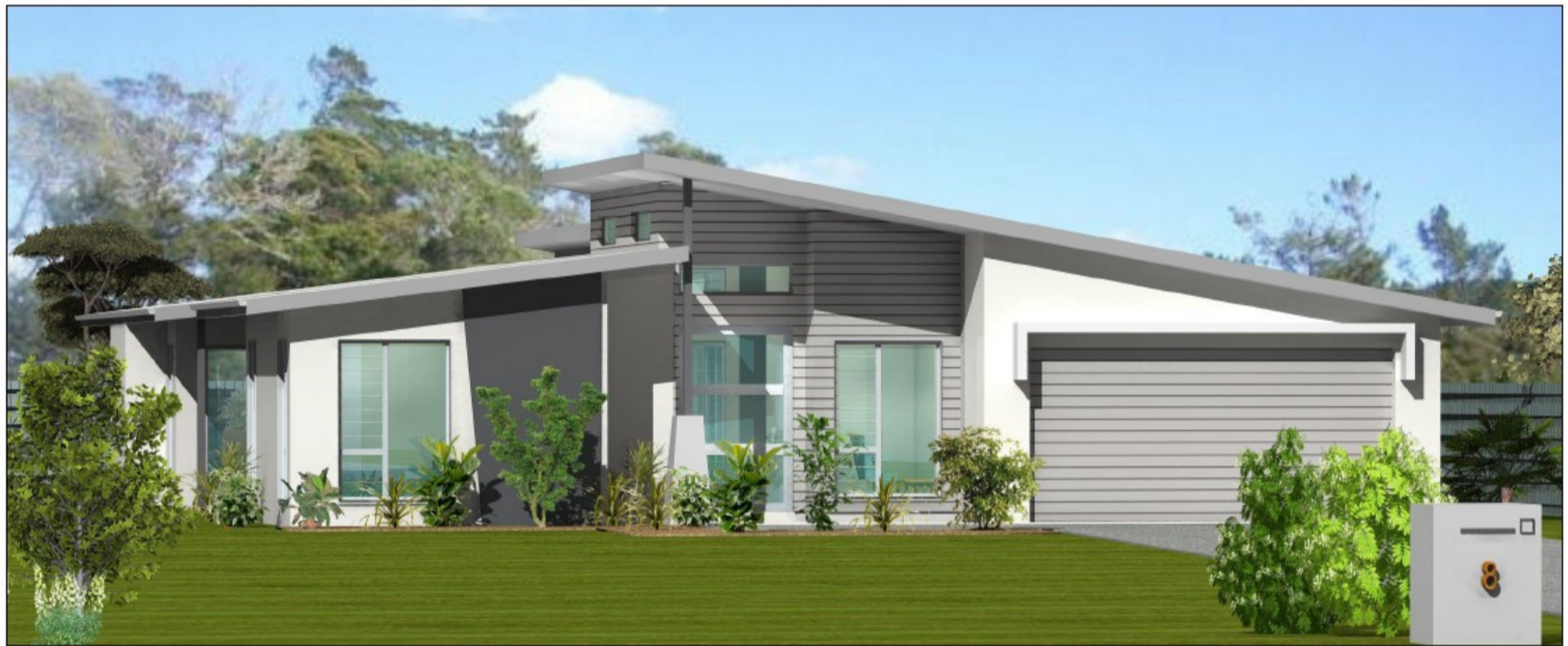
ARTIST'S IMPRESSION - LANDSCAPING FOR ILLUSTRATION PURPOSES ONLY